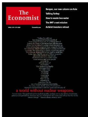
Fig.1 Obama's Prague address 5

When the cover of The Economist featured Barack Obama's Prague 2009 speech writ as a familiar mushroom cloud, the iconic image codified a universal enemy (the split atom) that threatens the entire planet (Fig.1). We are all in this together, goes the rhetorical strategy; the world is here, and our common task is to secure life against existing wrong. The apocalyptic cover, a staple for The Economist these days, exemplifies the totalizing world picture, the abstract global that finds ample representation across media.