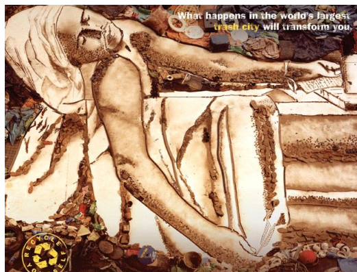
Fig.2 Vik Muniz' self-portrait

By contrast, it is far harder to sort, select, and assemble those speculative media that aspire to a world “to come,” a becoming that remains latent and uncertain. An example appropriate to the following discussion arrives amid squalor. When artistic collaboration on a documentary, Waste Land (2010), inserted Vik Muniz, one of the recyclers at Rio de Janeiro's infamous Jardim Gramacho dump, into an iconic image reminiscent of the French revolution (Jacques-Louis David's The Death of Marat , 1793), the exuberant appropriation of “high art” signaled local aspirations to become worldly—local, in the concrete recycled raw materials of the self-portrait (Fig.2). 6 The portrait would enter the world art circuit, the recesses of the global haunting the metropolitan centers where the exhibit traveled.